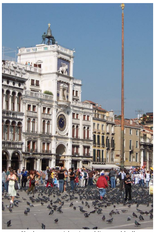
Clock tower with winged lion and bell