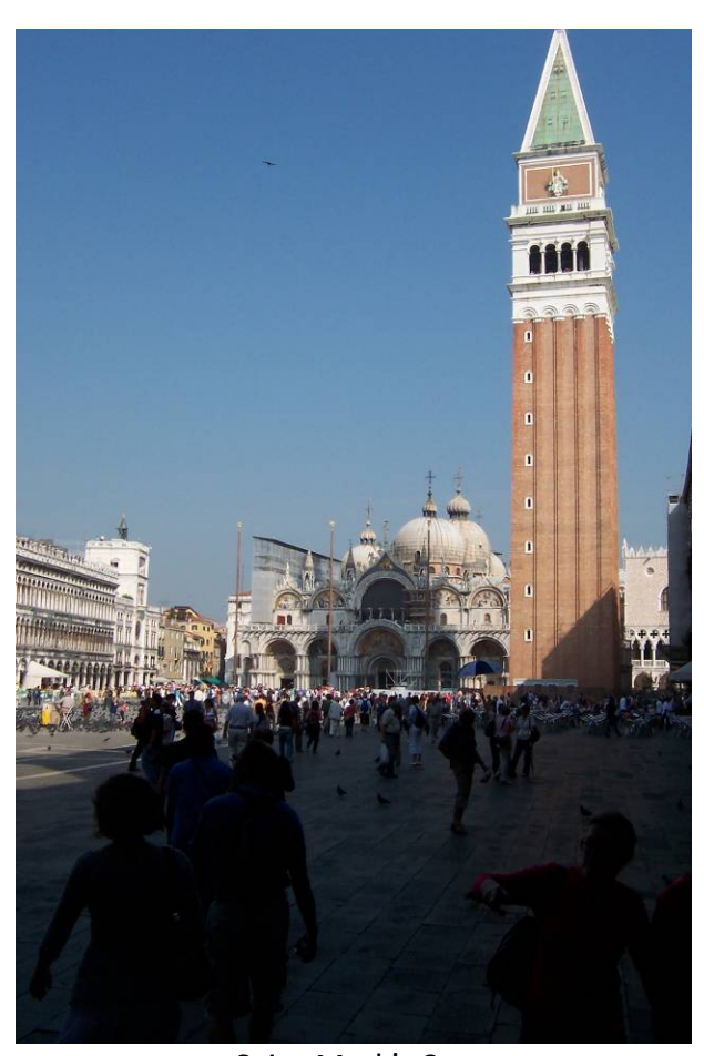
Saint Mark's Square