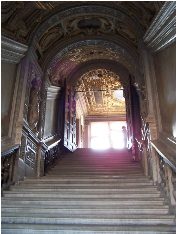
The Golden Stairs