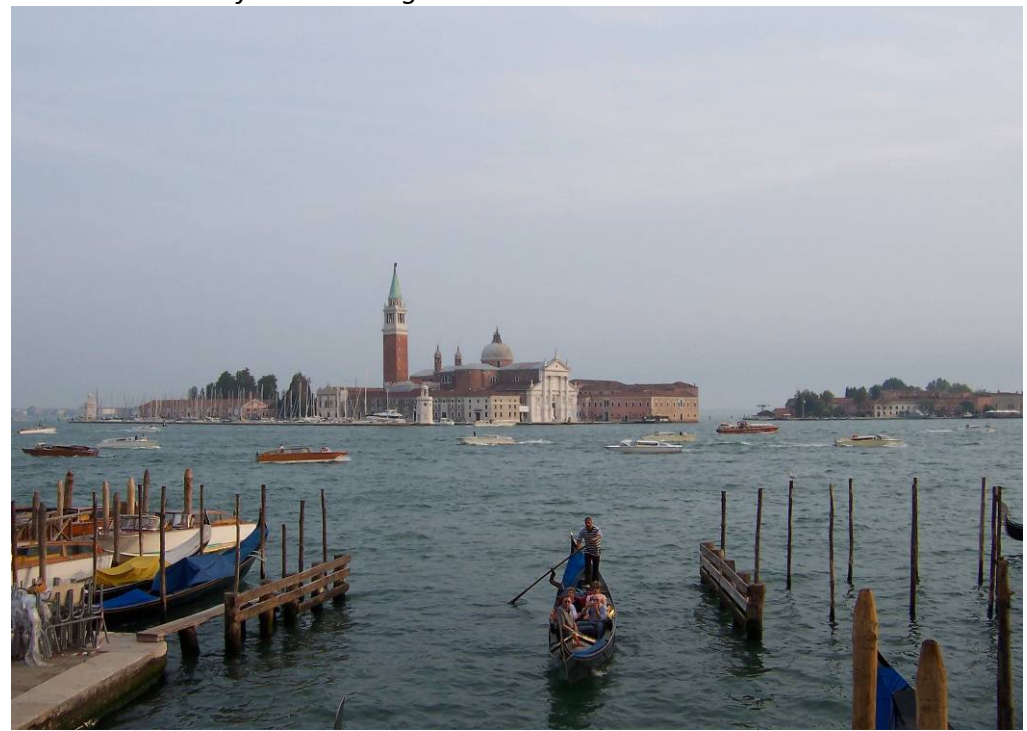
A view of Venice across the lagoon

See some of the same sights that Jack and Annie saw in the book!