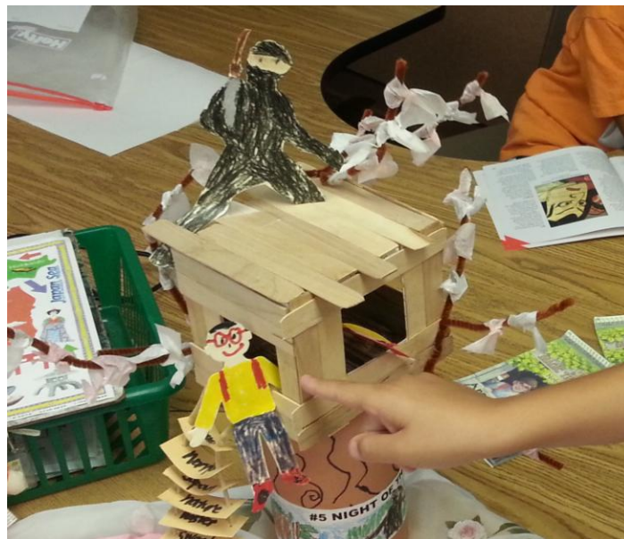
This student created a Tree House using the Forest of Magic Tree House lesson under Lesson Plans & Activities for all Magic Tree House books