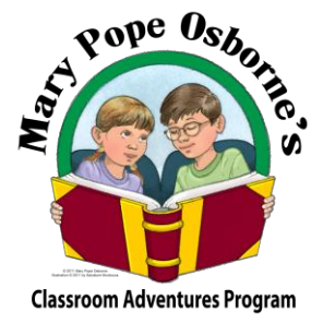
Bonus Activity Magic Tree House: A Big Day for Baseball